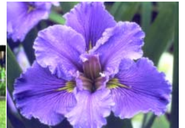
(above) 'Duval Bluebird' (left) 'Rose Cartwheel'

tion of The Louisiana Iris published by the Society in 2000. It is a hard cover book of 254 pages with 116 color illustrations, published by Timber Press, 133 SW Second Ave, Suite 450, Portland, OR 97204-3527. Price is $34.95 plus $6.00 shipping cost.☺