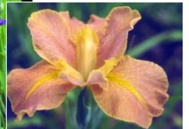
(above) 'Praline Festival'