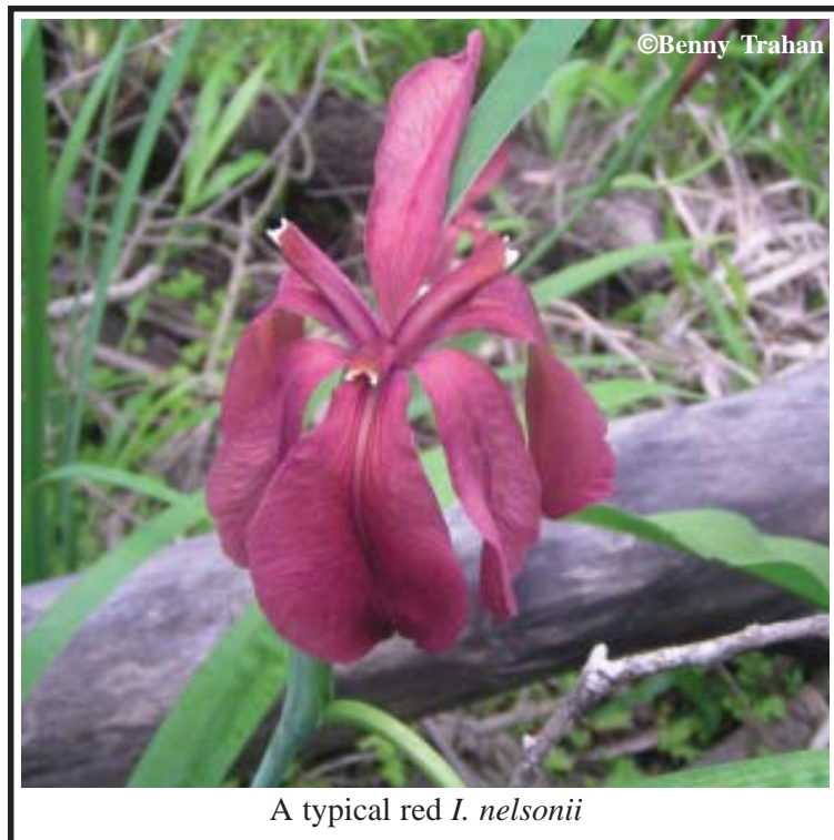
A typical red I. nelsonii