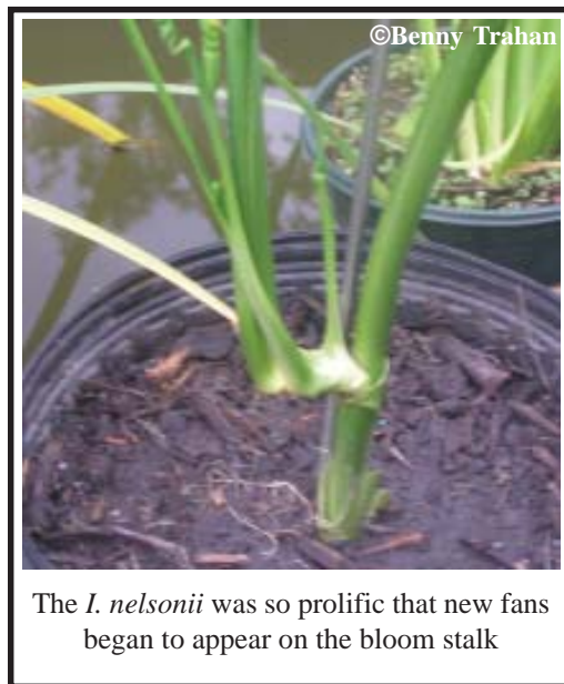
The I. nelsonii was so prolific that new fans began to appear on the bloom stalk

It is very disturbing to me that these beautiful irises, both the red and yellow I. nelsonii , are not going to be around in their natural habitat much longer. Their very small habitat is being filled in with rice hulls (30' high), being dried out by canals dug to drain sections of swamps and the sugar cane farmers are gradually claiming a little more of the swamps each year.